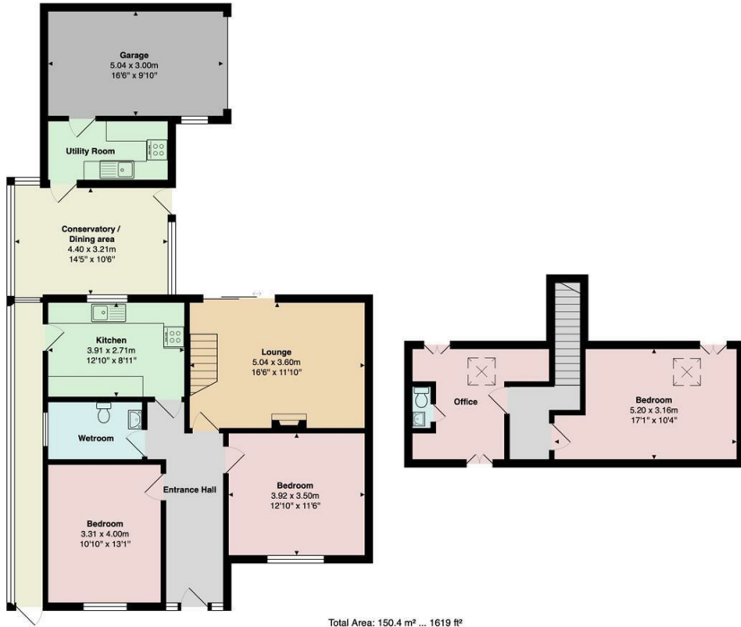
Total Area: 150.4 m 2 ... 1619 ft 2 All measurements are approximate and for display purposes only